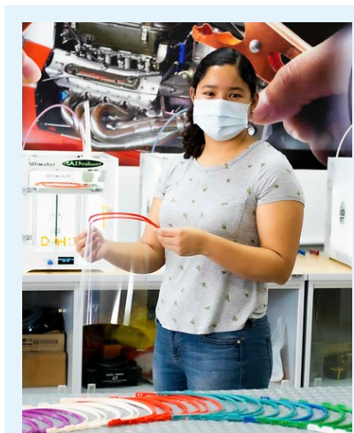
Funds from the ASHA grant helped outfit laboratories with durable goods, such as 3D printers. During the Covid pandemic, these facilities produced face shields and other protective equipment.

Additionally, USFUVG facilitated over $364,000 of support for UVG through the American Schools and Hospitals Abroad (ASHA) program within the US Agency for International Development (USAID). This support was part of a $1 million grant awarded in 2018. These funds were used for durable goods needed to support learning and instruction, including 3D printers and technology to facilitate online learning.