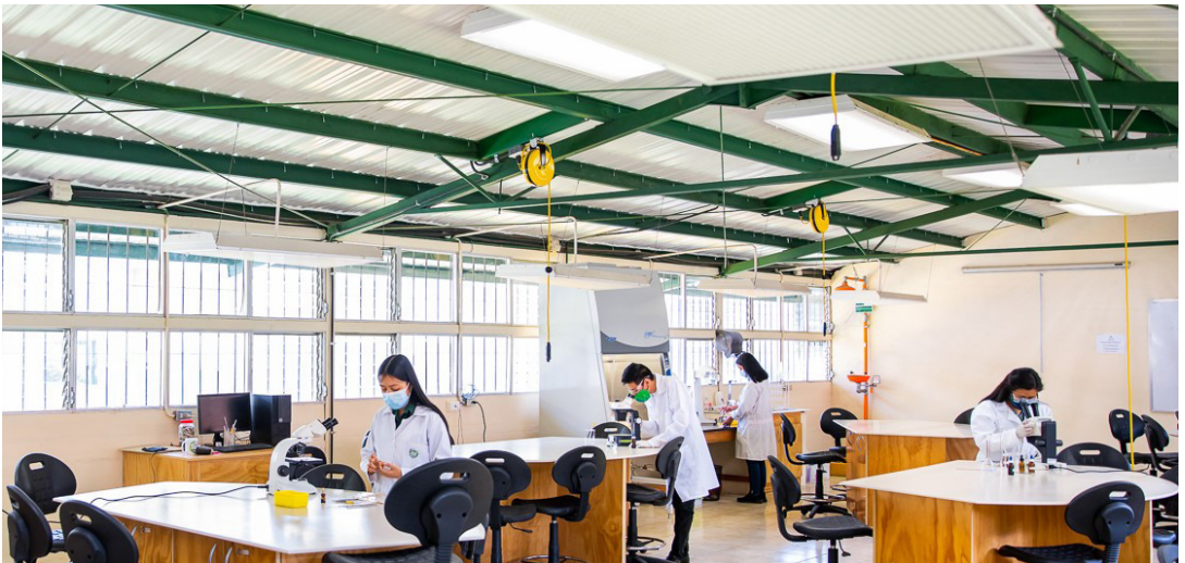
Altiplano students study life sciences in upgraded classrooms.

Impact - We ensure all our actions focus on the greatest needs and opportunities.