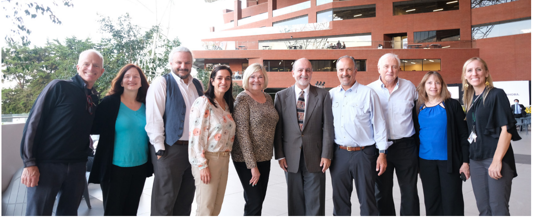
Trustees, Executive Director, and UVG staff at new CIT Building, Fall 2022 Board Meeting

The US Foundation of the University of the Valley of Guatemala is governed by a 16-member Board of Trustees. The Trustees meet twice a year, once in Washington, DC and once in Guatemala City at UVG. Much of the trustees' work is performed throughout the year in committees.